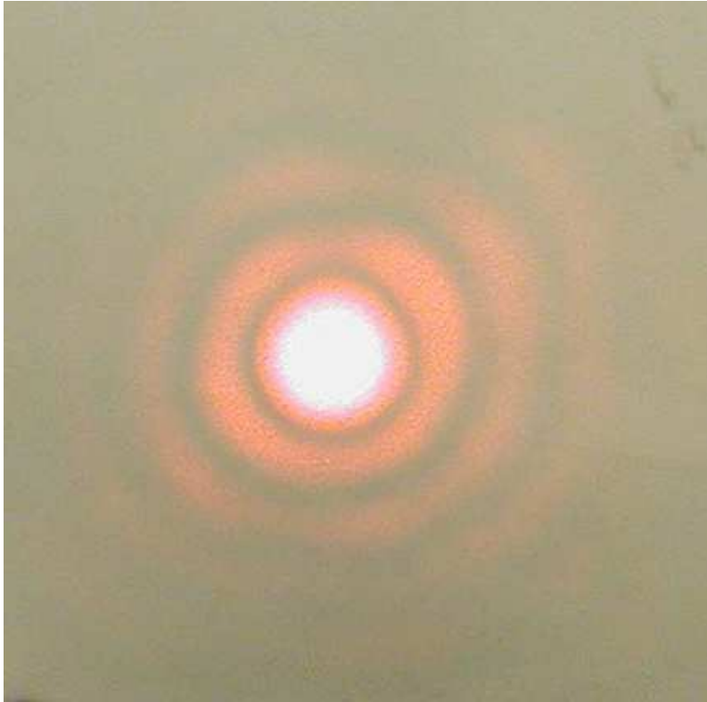
Figure 3: Output of the spatially filtered HeNe laser beam. The spatial filter was 10\ \mu\text{m} and the magnification of the objective was 20X ( f = 9\text{mm} , \text{NA}=0.4 ). The diffraction limited spot size after the objective was 13.89\ \mu\text{m} , so the output power in the central lobe was 22.8% of the input power. The pinhole in this photo was chosen to be somewhat small to show the diffraction rings. A properly filtered beam is a smooth, nearly Gaussian profile with no visible features. Rings like those shown can occur with a properly-size pinhole when the pinhole is not at the focus of the objective.