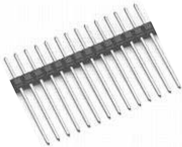
Male pin strip header